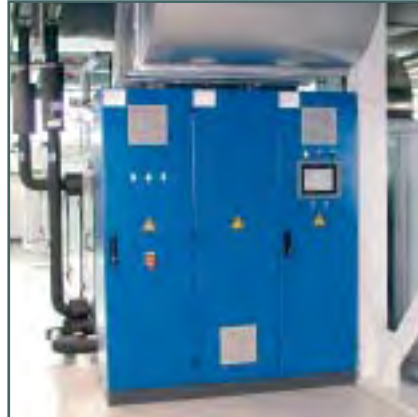
Control panels for heating, ventilation, air conditioning with integrated TFT touch panel operation

Due to the special power distribution and building services management requirements involved, more than 7,000 data points were implemented and networked for HVAC and process control and a further 1,500 data points